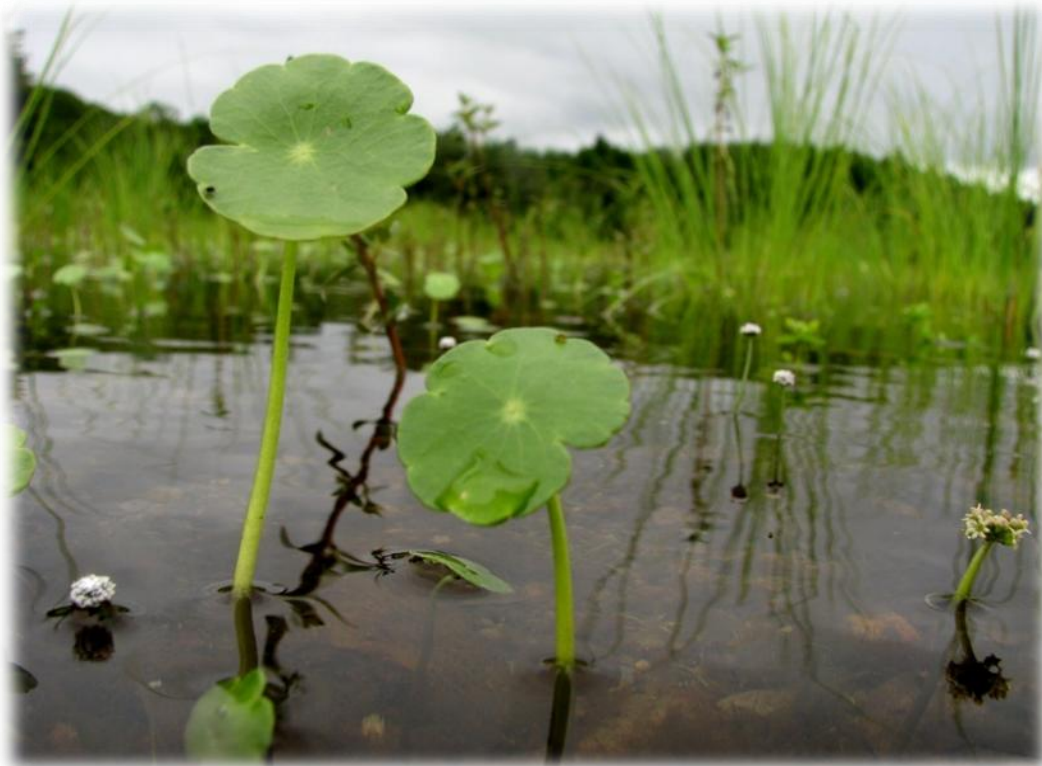
Water-pennywort on Kejimikujik Lake